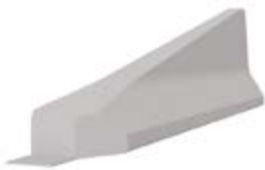
Terminal Element RB140SFS_6T (inclination 1:5)